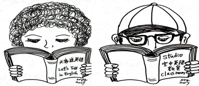
Covina Bethel English Class Newsweek

Covina Bethel English Class Englishclass4u@Englishclass4u.com Tel: (626) 332-8223 Studio Classroom Let's Talk in English Saturday, 9:00 am- 11:30 am Apr. 20, 2013